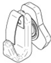
20 Security Hooks