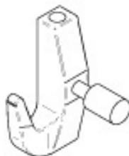
1 Multi-Purpose Hook